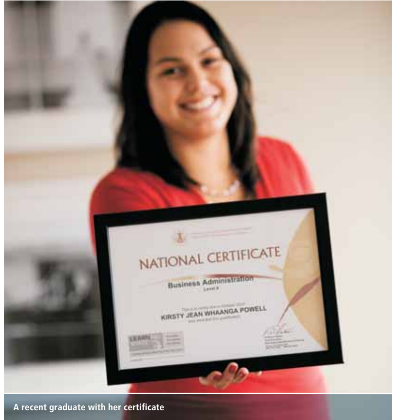
A recent graduate with her certificate

Certificate application forms are available on Learning State's website, www.learningstate.govt.nz (click on 'Workplace Assessors and Moderators' on the left of our home page and choose 'forms' from the menu).